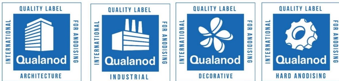
a) Label for architectural anodizing